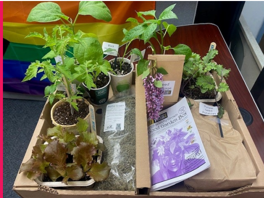
Our PURPLE themed Locally Grown Good Garden Box in June 2023

We work with self-identified women to increase their access to knowledge, skills and resources so they can make informed choices.